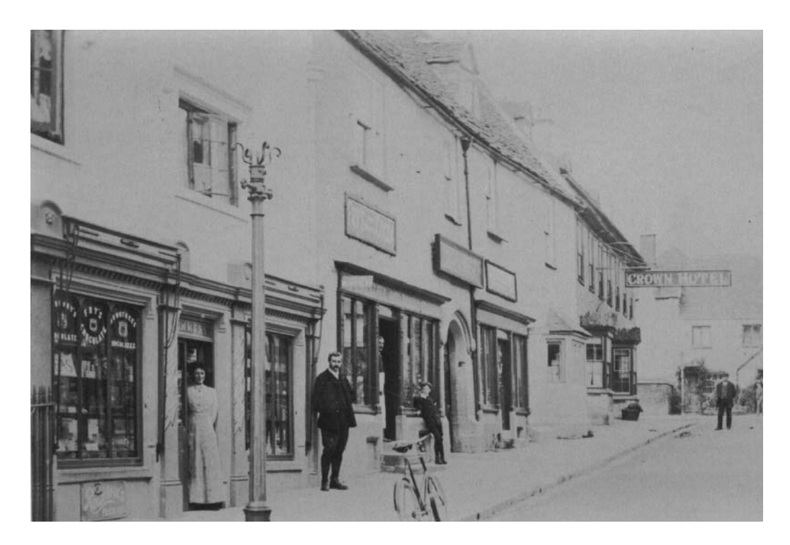
Early C20th Photograph of the premises adjoining the Crown. The three shops mentioned in the 1737 advertisement are probably those either side of the arch (now Arden Cottage and Arden House) and the bay window with the stone tiles.

who has a mind to engage as a partner, or buy the whole i.e. the medicines, drugs, utensils etc. N.B. No letters will be received unless post-paid nor any treated with, except the Principal in Person." Two months later the same newspaper advertised: "TO BE SOLD a very good strong built house in the town of Minchinhampton, Glos. adjoining to the side of the Crown, containing three shops, all facing the street, one of which is, or hath been, an Apothecary's Shop for above 40 years." Further research should indicate whether there were two premises regarded as apothecary's shops, or whether, as seems likely from the date coincidences, just one.