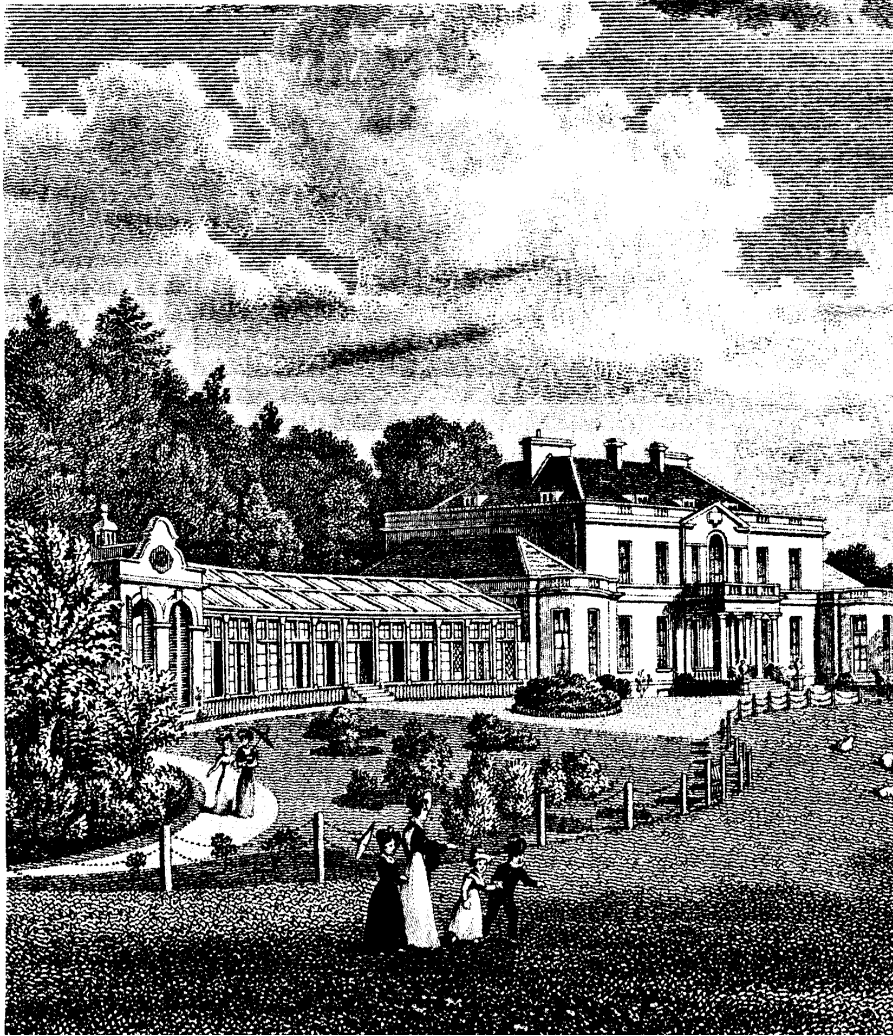
ENGRAVING OF GATCOMBE PARK

An engraving dated 1825 shows a small area in front of the house containing a lawn, a few shrubs and gravel paths. Beyond a small decorative fence of chains the park falls away to the south; here the trees have been pruned to look as though naturally grazed by animals and a few sheep enliven the scene.