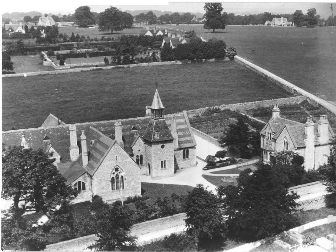
School and School House in 1935

Morning lessons had to finish by 11.50 for children to wash their hands, and for the helpers to lay the desks for dinner. We had bowls fixed in the cloakroom for the children; the supervisor had to see each child wash their hands which took quite a time! About 60 children stayed to dinner and meals were brought from Dudbridge Canteen, they cost five pence a day. Local parents and friends helped to serve the dinners on a long table at the back of a classroom, and several carried trays of dinners to the Infant rooms. American cloths were laid on desks, with cutlery and beakers of water. After lunch plates were washed in the china sink, which was fixed in the small porch attached to the smaller Infant classroom, then the cloths were washed, left to dry, rolled up and stored in the cupboard, also fixed in the porch, before afternoon session. A gas ring in the porch was used to boil a kettle for tea or coffee at dinner time for the Infant teachers.