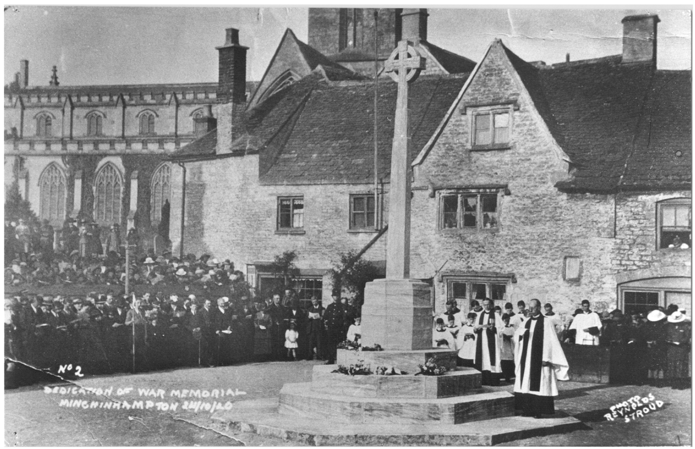
AN EARLY PHOTOGRAPH OF THE WAR MEMORIAL A WHITSUNTIDE PROCESSION

All information obtained from copies of the Parish Magazine.